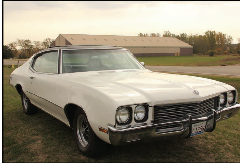
This 1972 Buick Skylark SunCoupe will be given away at the 2013 MEE Car Show.

A new event based on an old classic is coming to MALCOLM EATON's 19th Annual Pork Chop Dinner & Car Show on May 19, 2013. The organization is raffling off a 1972 Buick Skylark SunCoupe, one of fewer than 3,950 such cars produced in this model year. The SunCoupe roof — like