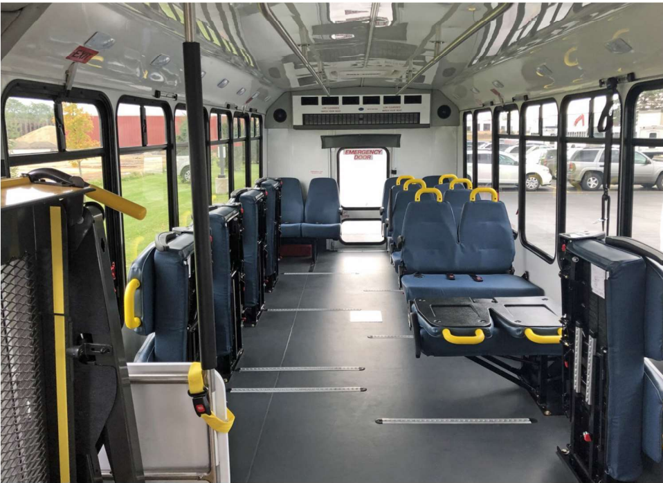
This is a look inside of the new vehicles that Malcolm Eaton acquired through the State’s Vehicle Procurement Program. The new vehicles feature some of the newest safety innovations available, ensuring that everyone is transported as safely and comfortably as possible.

Malcolm Eaton Enterprises provides transportation to almost 180 individuals each day. Each year, Malcolm Eaton’s fleet collectively travels over 200,000 miles.