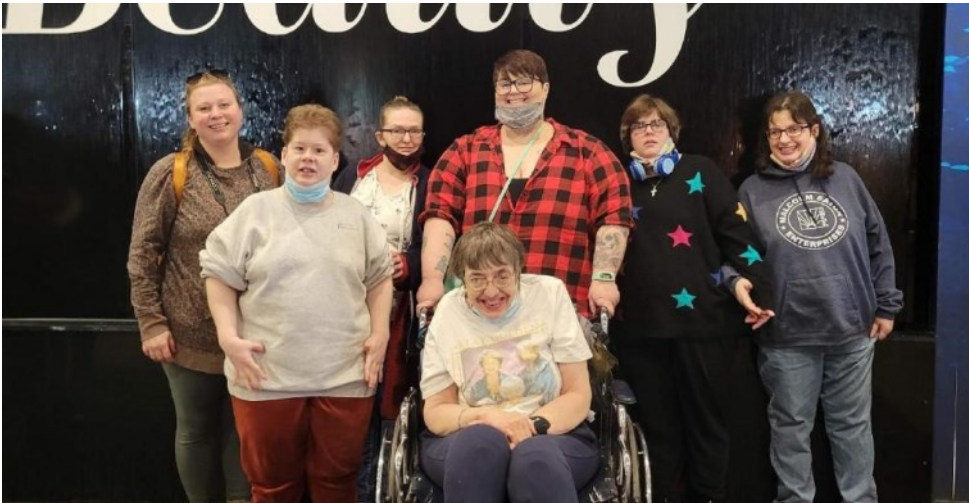
Residents and staff from the Wilson house, one of MEE's 24-hour residential homes, visit the Underwater Beauty exhibit at the Shedd Aquarium on April 9th.