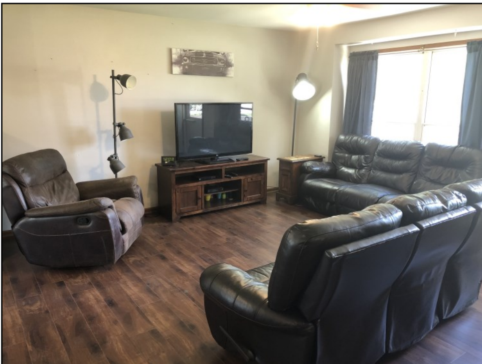
The newly renovated living room in our men's CILA features an open floorplan that will make it easier for individuals with mobility issues to use.