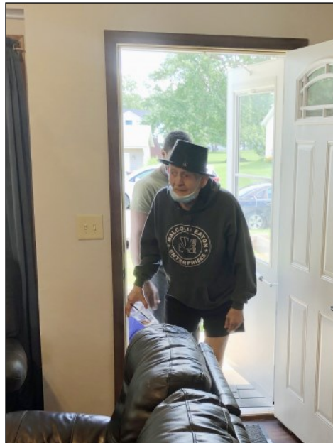
One of the residents from our newly renovated CILA home returns from camp to see an all-new living room, dining room, and kitchen.

In addition to removing the wall, new baseboard trim was installed throughout the kitchen, dining area and living room.