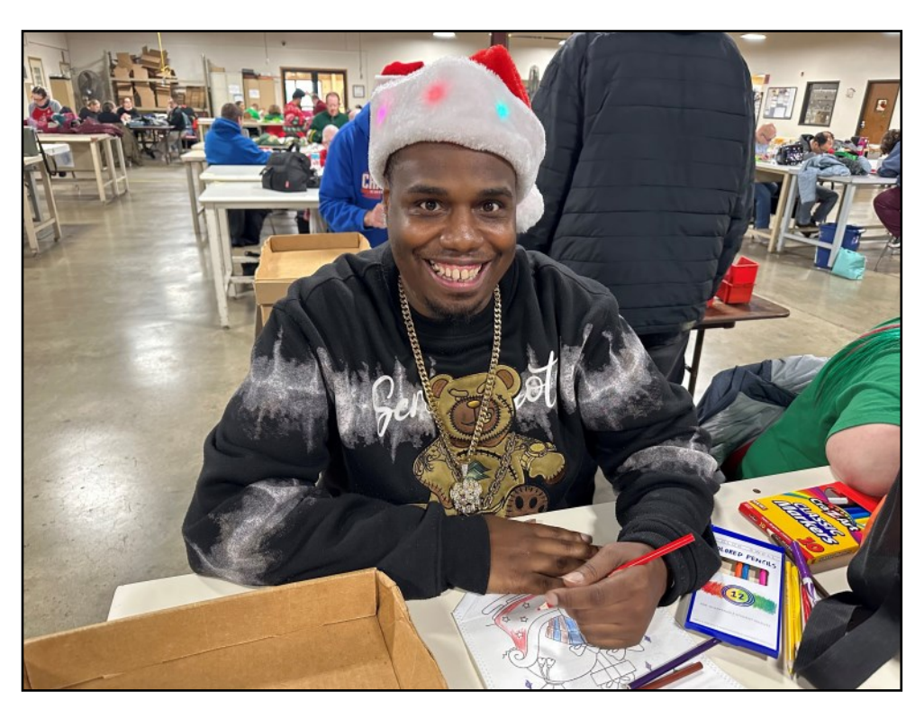
With more craft stations than ever before, individuals had plenty of different ways to show off their creativity.