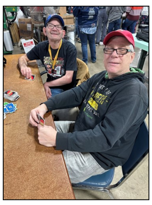
In addition to crafts and dancing, there was plenty of fun to be had playing games such as Bingo (left) or Uno (right).